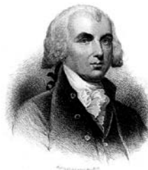
James Madison, Author of the U.S. Constitution

"If Congress can employ money indefinitely to the general welfare , and are the sole and supreme judges of the general welfare, they may take the care of religion into their own hands; they may appoint teachers in every State, county and parish and pay them out of their public treasury; they may take into their own hands the education of children, establishing in like manner schools throughout the Union; they may assume the provision of the poor; they may undertake the regulation of all roads other than post-roads; in short, everything, from the highest object of state legislation down to the most minute object of police, would be thrown under the power of Congress.... Were the power of Congress to be established in the latitude contended for, it would subvert the very foundations, and transmute the very nature of the limited Government established by the people of America ."